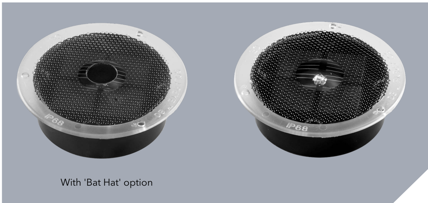
With 'Bat Hat' option